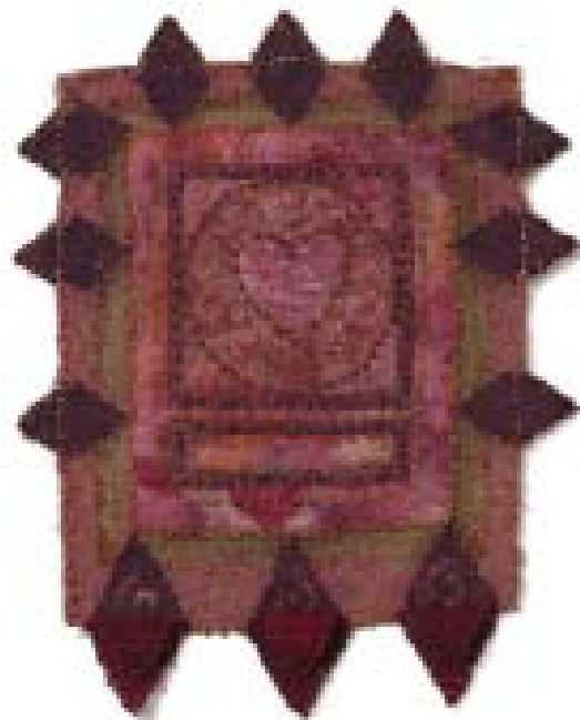
"Adventures in Feltmaking for Embroidery" Sarah Lawrence, Page 44