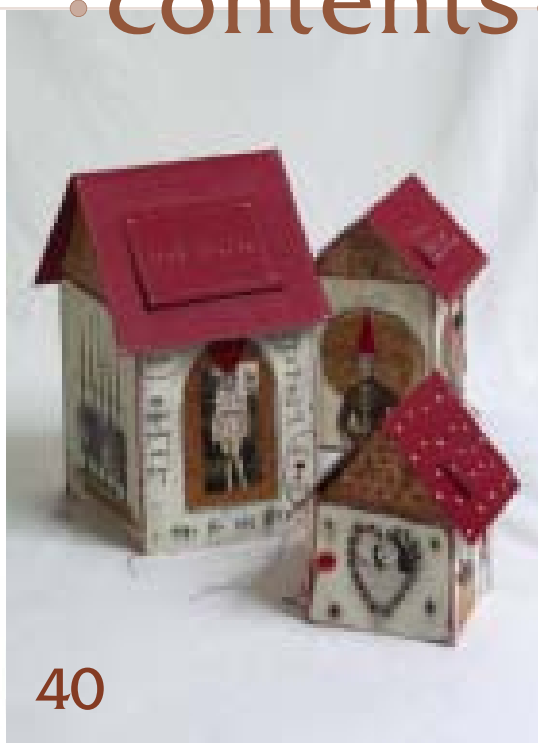
"If These Walls Could Talk" by Lynn Whipple, Page 40